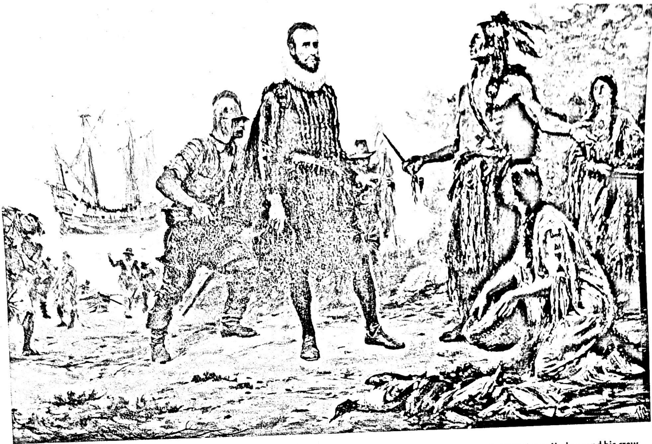
In 1609 Henry Hudson and his crew landed on the shores of Delaware Bay. The native people offered goods for trade.

In 1535 French explorer Jacques Cartier (kahr•tee•AY) sailed up the St. Lawrence River, hoping it would lead to the Pacific. Cartier did not make it to the Pacific, but he discovered a mountain peak that he named Mont-Royal, which means “royal mountain.” This is the site of the present-day city of Montreal.