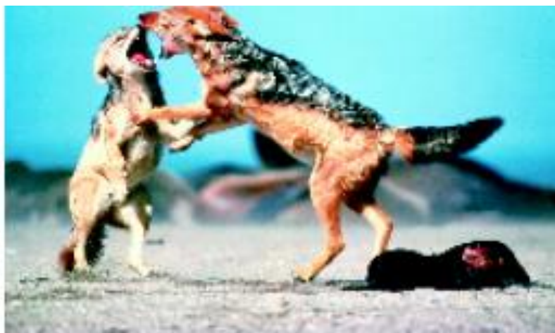
FIGURE 9 Food as a Limiting Factor These jackals are fighting over the limited food available to them.