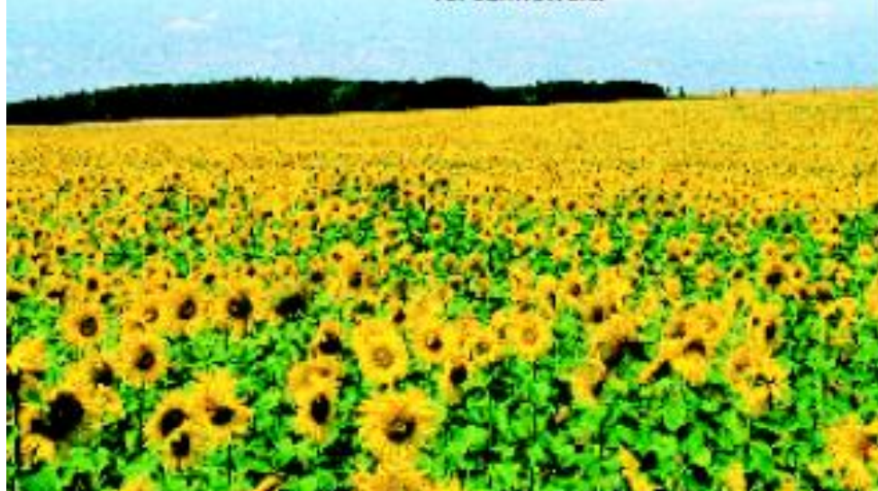
FIGURE 10 Space as a Limiting Factor Could any more sunflower plants grow in this field? If not, the field has reached its carrying capacity for sunflowers.

Space is also a limiting factor for plants. The amount of space in which a plant grows determines whether the plant can obtain the sunlight, water, and soil nutrients it needs. For example, many pine seedlings sprout each year in a forest. But as the seedlings grow, the roots of those that are too close together run out of space. Branches from other trees may block the sunlight the seedlings need. Some of the seedlings then die, limiting the size of the pine population.