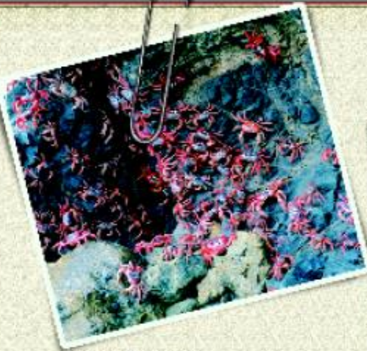
Direct Observation Counting these crabs one by one is an example of direct observation.

Scientists use a variety of methods to determine the size of a population.