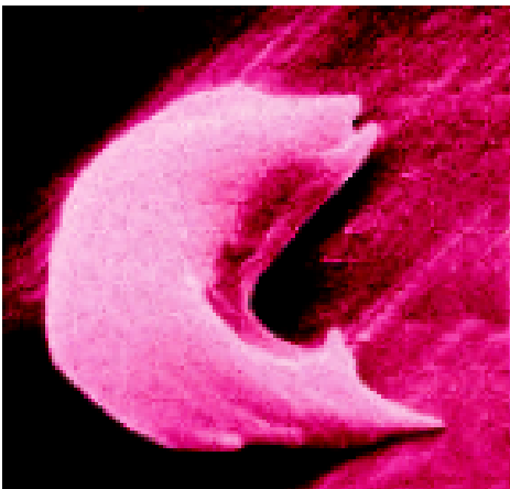
FIGURE 9 Sickle-Cell Disease Normally, red blood cells are shaped like round disks (top). In a person with sickle-cell disease, red blood cells can become sickle-shaped (bottom).