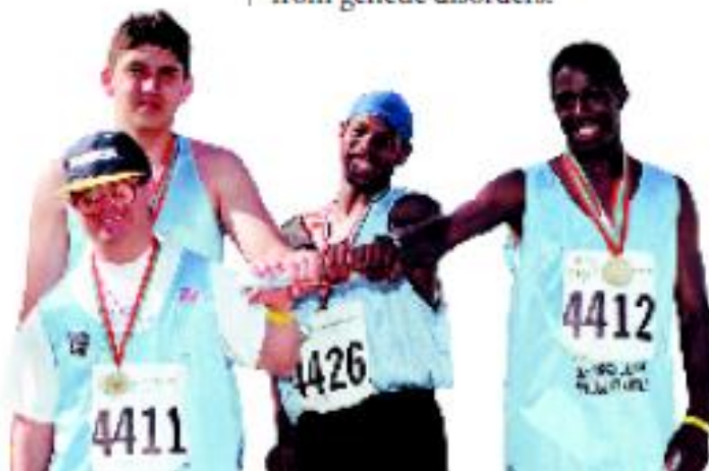
Runners in the Special Olympics

The air inside the stadium was hot and still. The crowd cheered loudly as the runners approached the starting blocks. At the crack of the starter's gun, the runners leaped into motion and sprinted down the track. Seconds later, the race was over. The runners, bursting with pride, hugged each other and their coaches. These athletes were running in the Special Olympics, a competition for people with disabilities. Many of the athletes who compete in the Special Olympics have disabilities that result from genetic disorders.