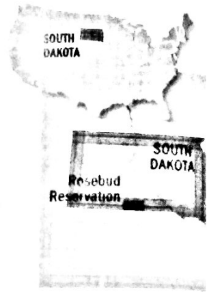
The Rosebud Reservation in South Dakota